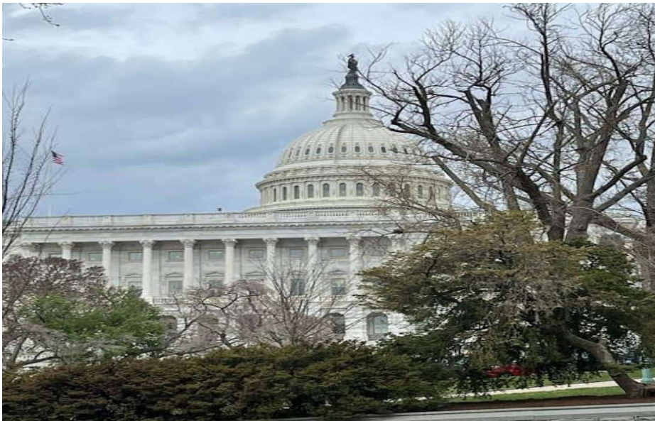
U.S. Capitol in Washington D.C.