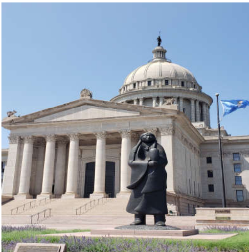
Oklahoma State Capitol in Oklahoma City, Oklahoma