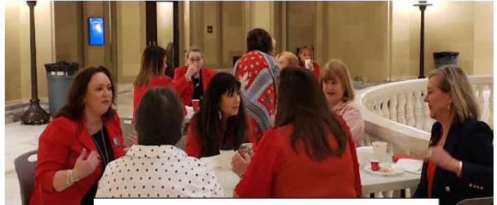
Ladies enjoying lunch during the OKFRW Red Coat day 2022 at the Oklahoma State Capitol