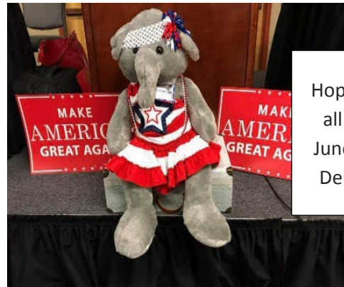
Hope to see all of you June 18 th in Del City!!!