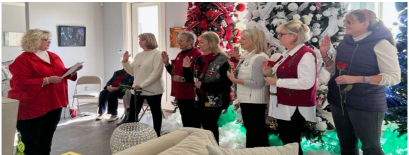
Swearing in of the Edmond Republican Women's 2023 Officers