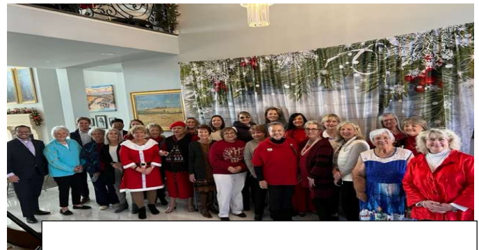
Group at the OKFRW Christmas Tea 2022