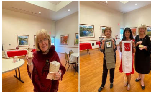
More for the June Board Meeting (blocks L-R and top to bottom):