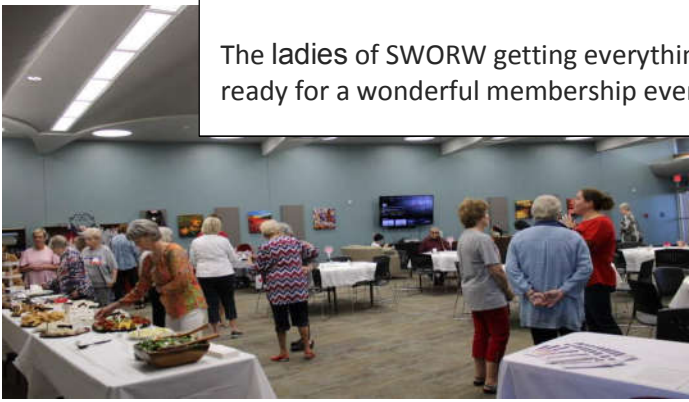
The ladies of SWORW getting everything ready for a wonderful membership event