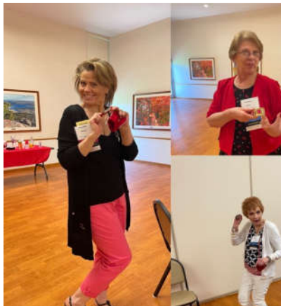
The ladies of OKFRW : at the June Board mtg (blocks L-R):

Election Day: Tuesday, November 8, 7 AM - 7 PM