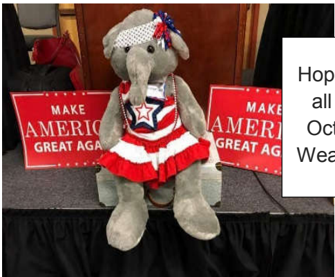
Hope to see all of you Oct 29 th in Weatherford