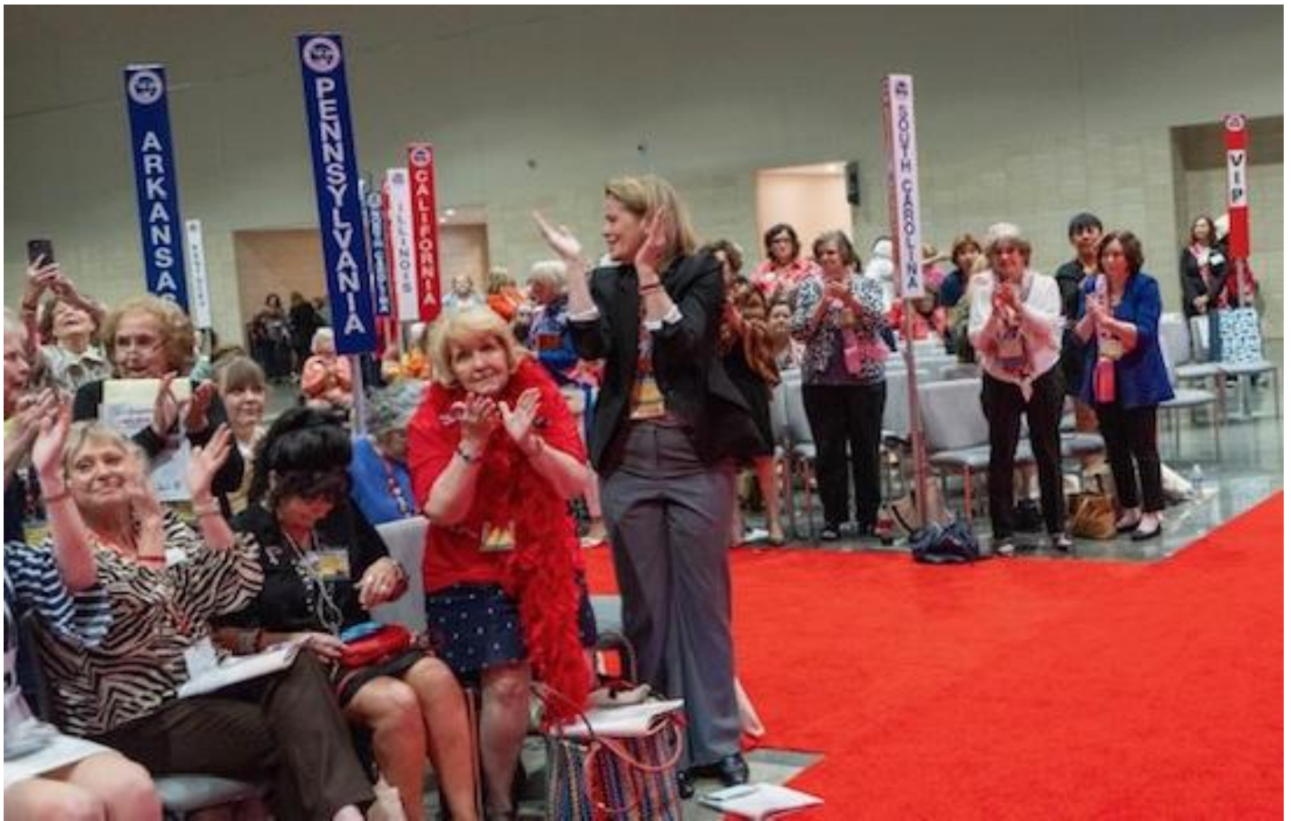
Above: OKFRW Members had a great time at the NFRW Convention!