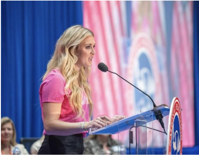
Left: Former University of Kentucky swimmer and now advocate for female athletes' rights Riley Gaines addresses the NFRW Convention.