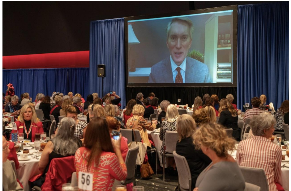
Below: Senator James Lankford spoke to the Convention via zoom at the Saturday luncheon.