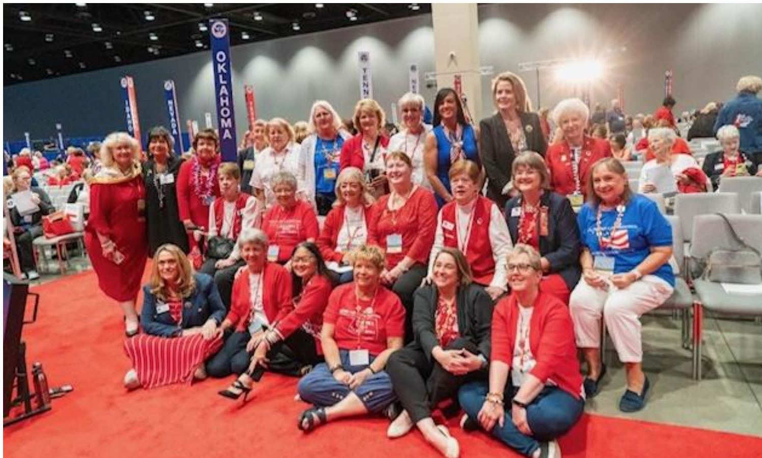
Above: OKFRW members pause from hosting the NFRW Convention in Oklahoma City.