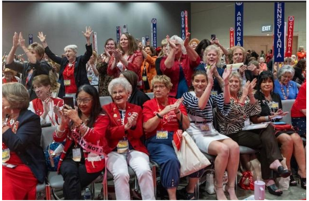
Above: OKFRW ladies had a lot of fun hosting the NFRW Convention!